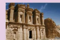
one of the seven wonders